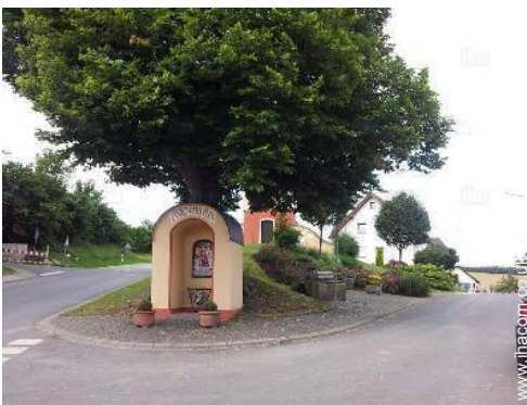
view of the village