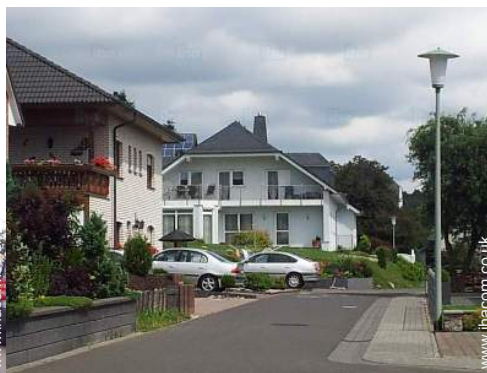
block of flats