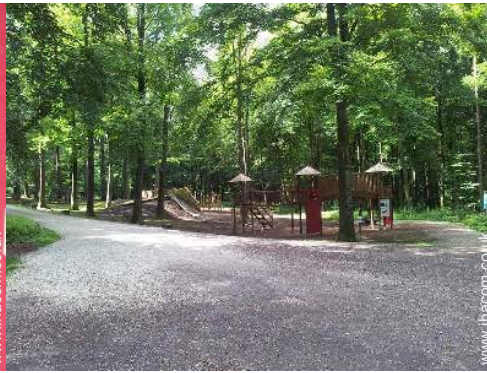
view over the forest