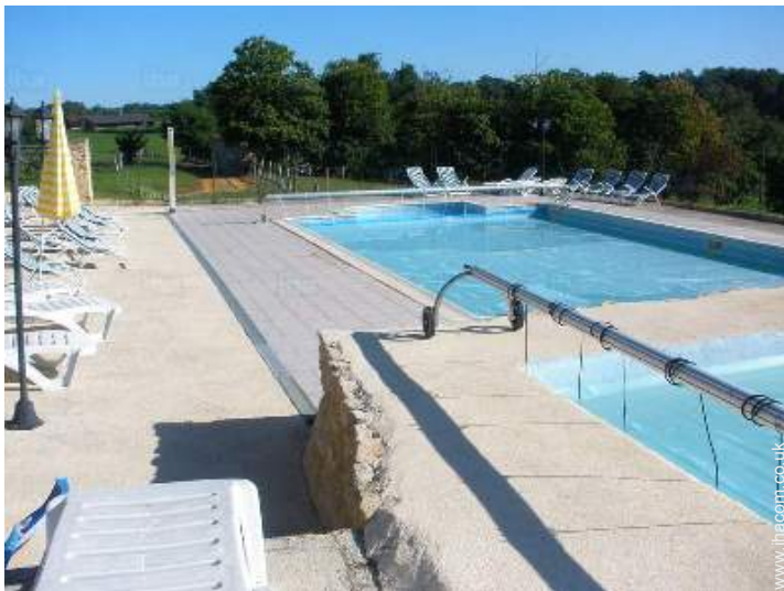
view from the swimming pool