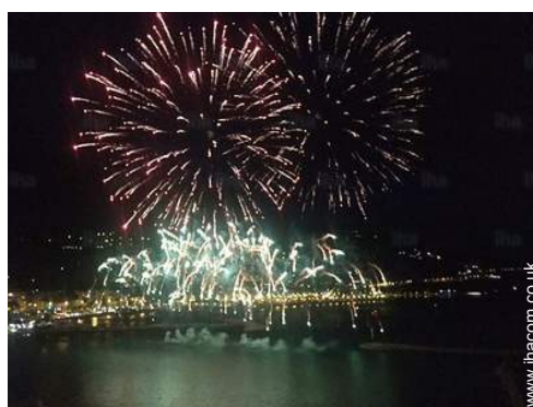
view of the port