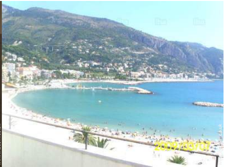
view from the roof terrace