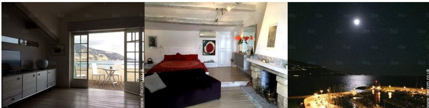
view from the roof terrace