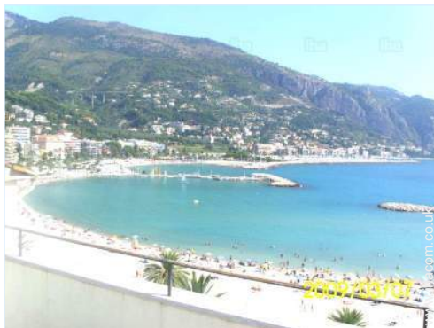
view from the roof terrace