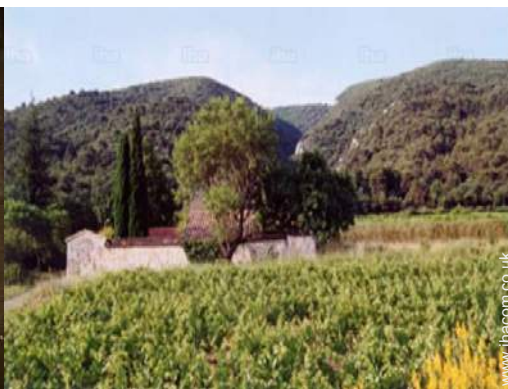
view from the house