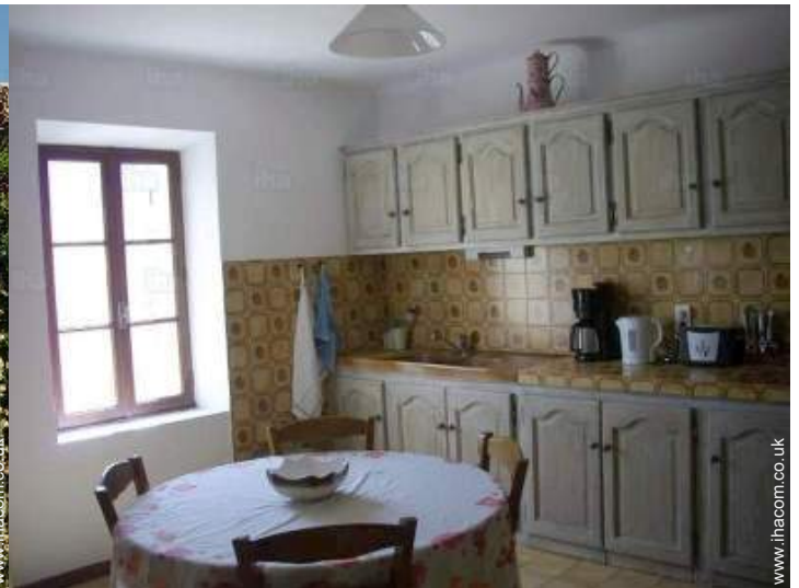
large separate kitchen