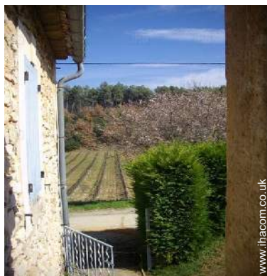
view over vineyard