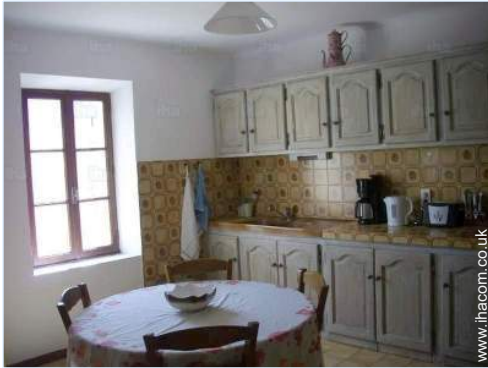
large separate kitchen