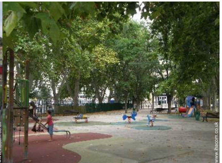
park and garden