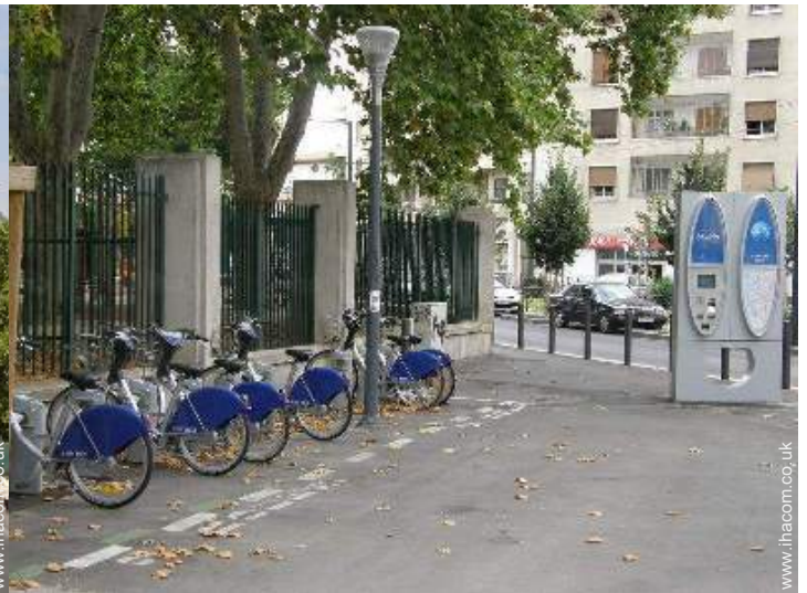
bike/mountain bike hire