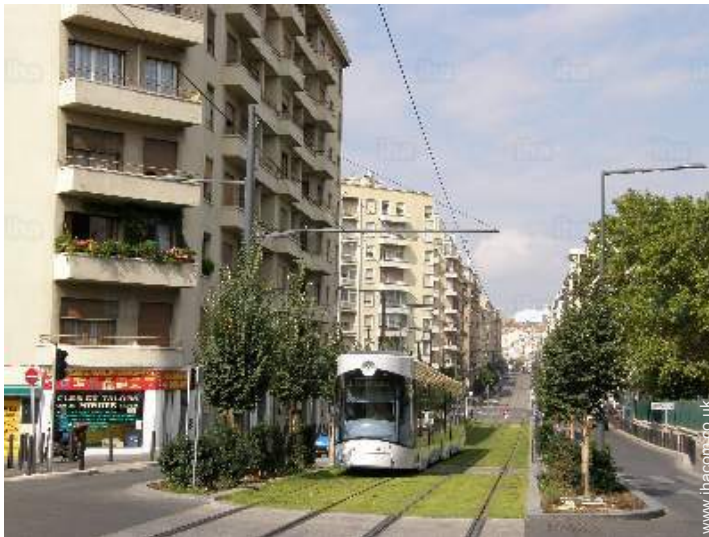
block of flats