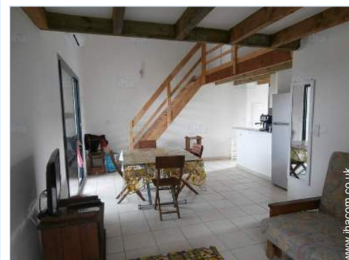
sofa bed(s) 2 pers