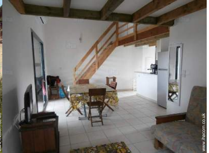
sofa bed(s) 2 pers