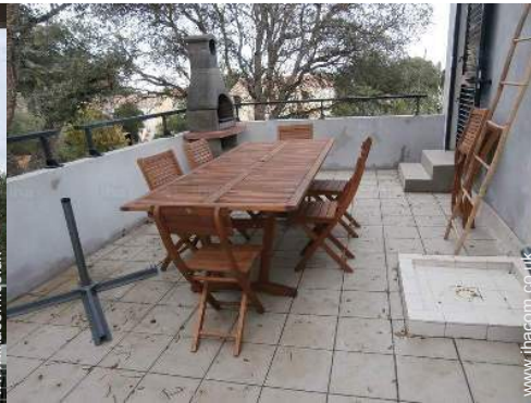
outside shower facilities