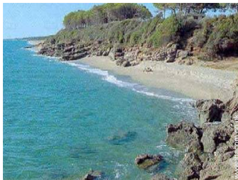
summer sports nearby