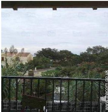
view from the covered terrace