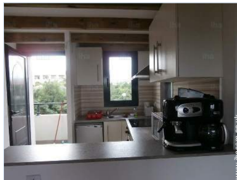
electric espresso coffee maker