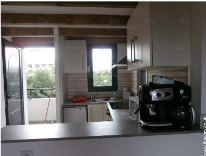
electric espresso coffee maker