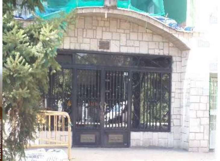
block of flats