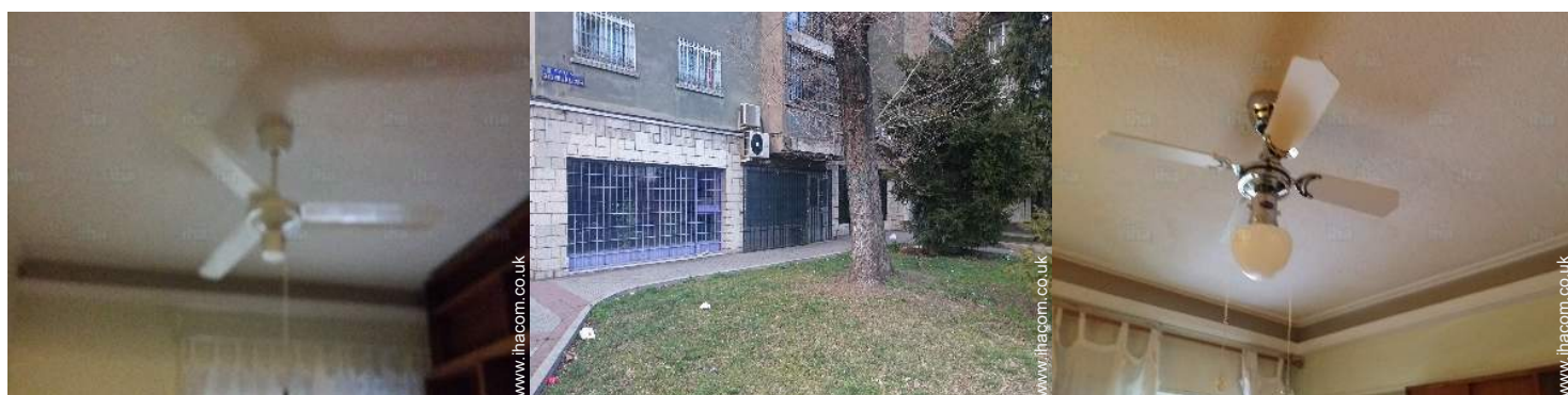
entry phone system