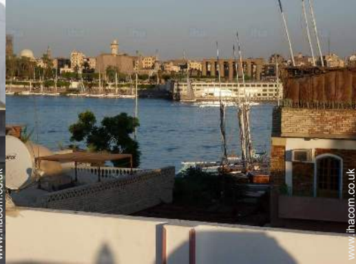
view from the roof terrace