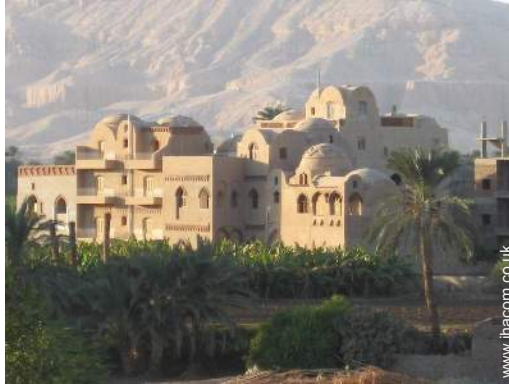
view from the roof terrace