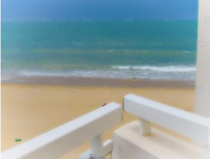
view from the flat