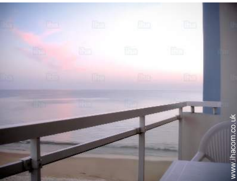
view of the sunset