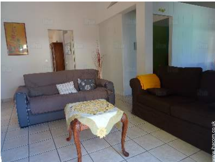
sofa bed(s) 2 pers