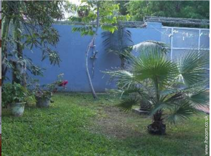
outside shower facilities