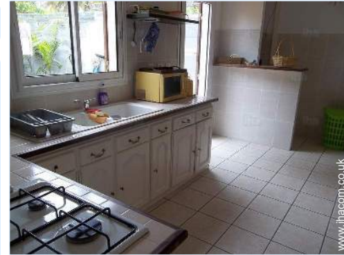
large separate kitchen