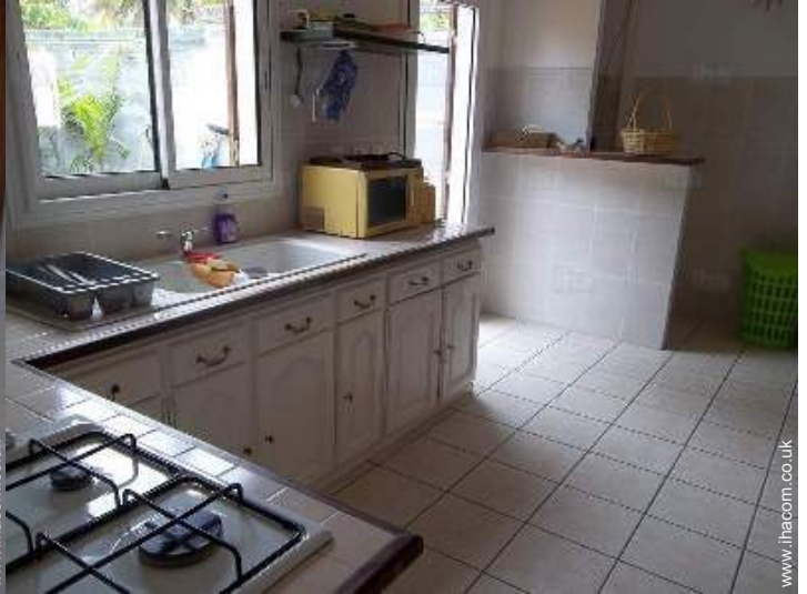
large separate kitchen