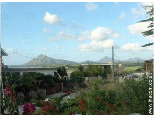
view over the mountain