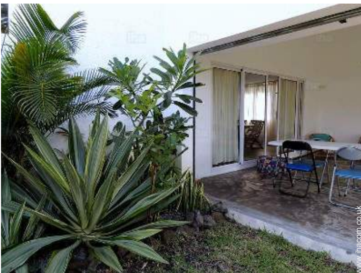
view from the veranda