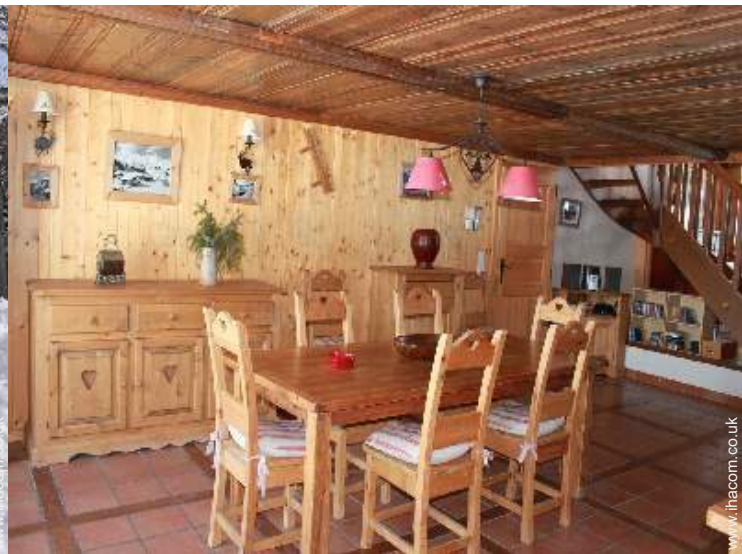
view from the dining-room