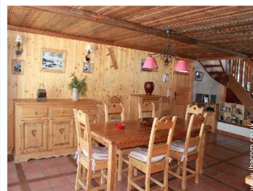
view from the dining-room