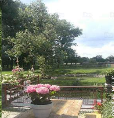
view from the veranda