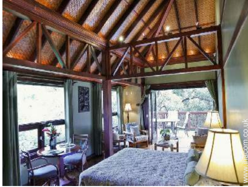
general floor plan