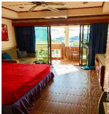
Guest facilities and furnishings