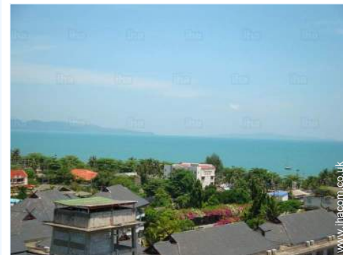
view over the ocean

Bus stop / bus station 330' Scooter/motorbike hire <165' Car rental 0.3mi. Scuba diving material hire 0.62mi. Household linens for hire/laundry services 165' Breadshop <165' Caterer <165' Supermarket Hairdressing salon <165' Internet cafe 330' Bank 330' Chemist 330' Doctor 0.93mi. Hospital 1.85mi.