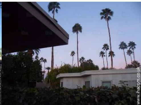
view from the patio