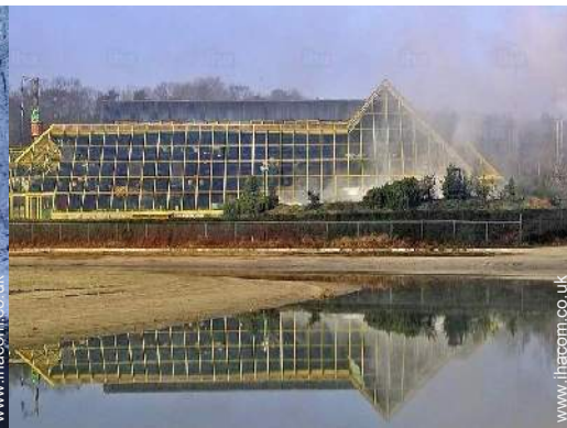
seaside pursuits nearby