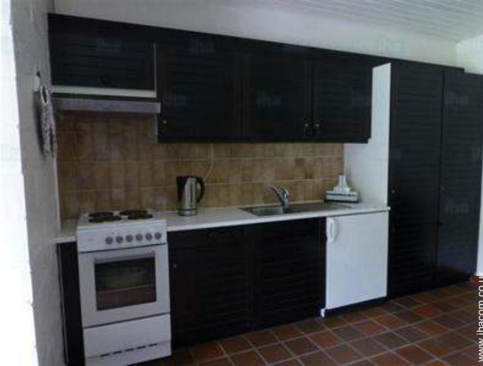
american style kitchen