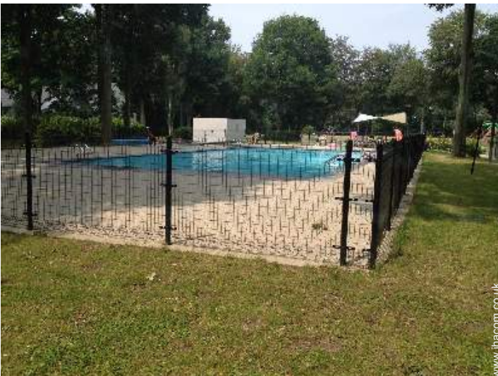
heated swimming pool