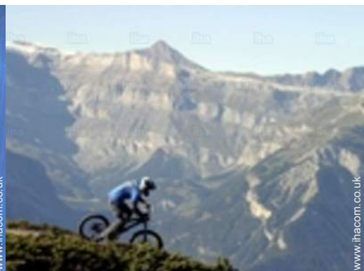
bike/mountain bike hire