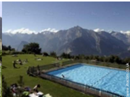
public swimming pool