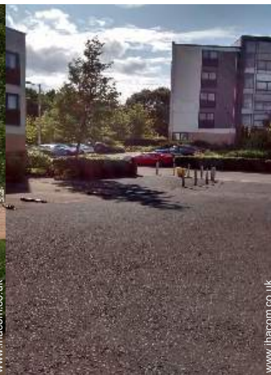
View from the property