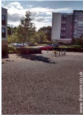
View from the property