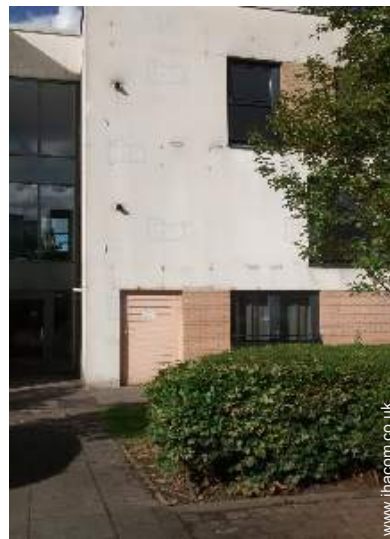
block of flats