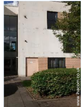
block of flats