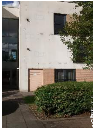
block of flats