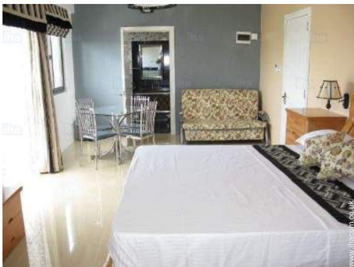
Guest facilities and furnishings