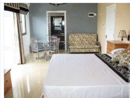
Guest facilities and furnishings