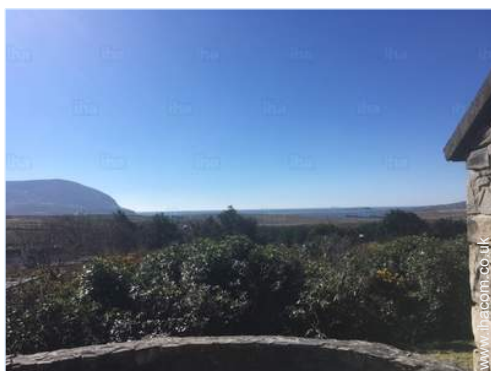
view from the patio