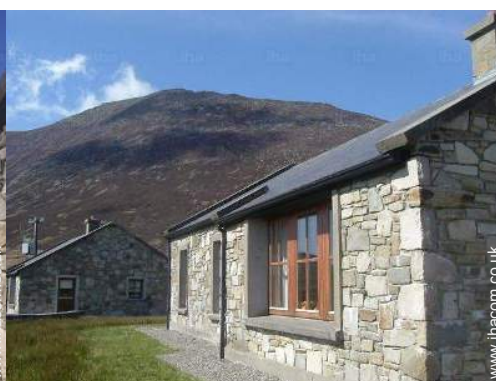
view from the patio