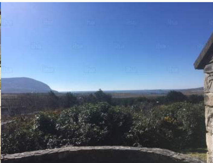
view from the patio