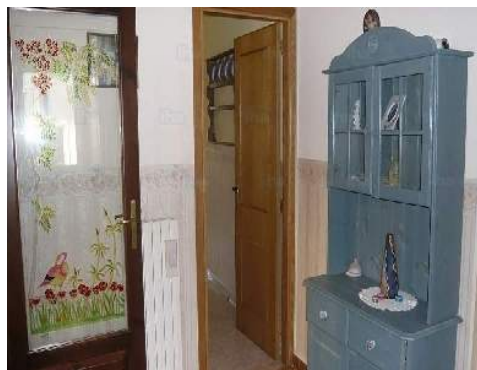
Interior layout at guests disposal