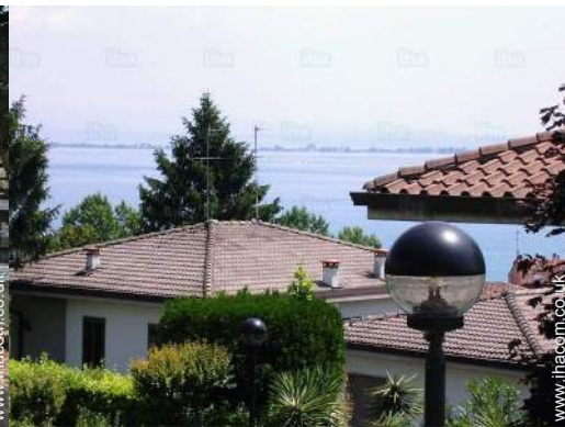
view from the bedroom