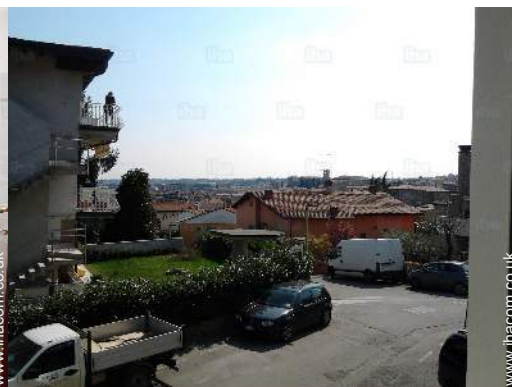
view from the house