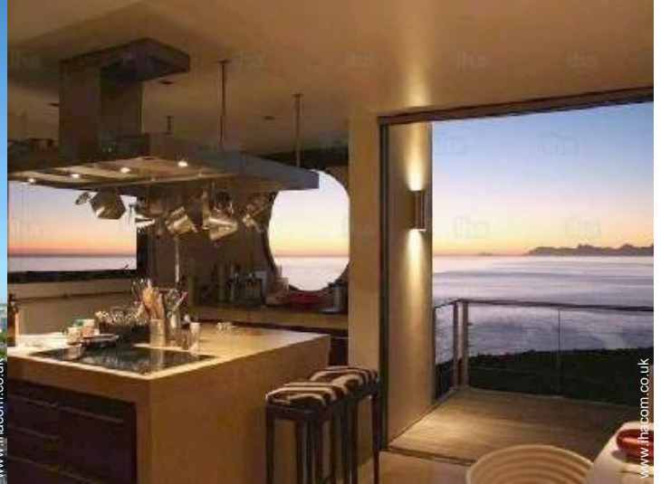
view of the sunset