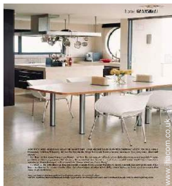
large american style kitchen