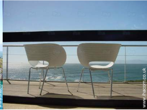
view from the balcony