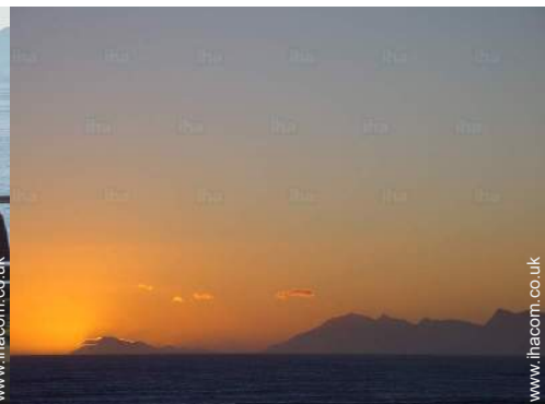
view over the ocean