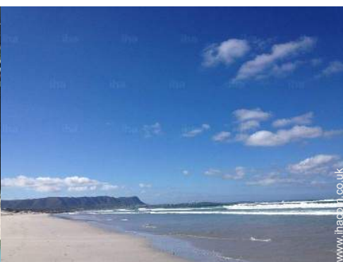
seaside pursuits nearby