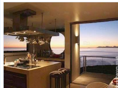
view of the sunset