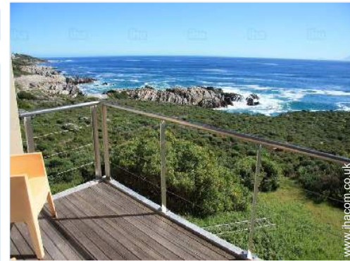
view over the sea

BBQ, garden table(s), 12 garden seat(s), 5 chaise(s) longue(s), outside shower facilities