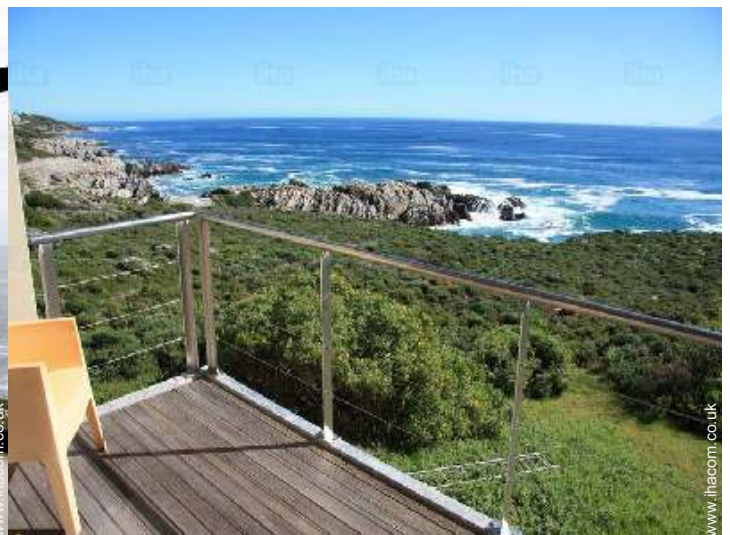
view over the sea