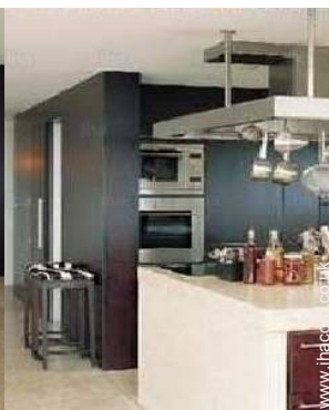
large american style kitchen