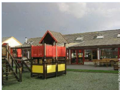
Attractions and relaxation