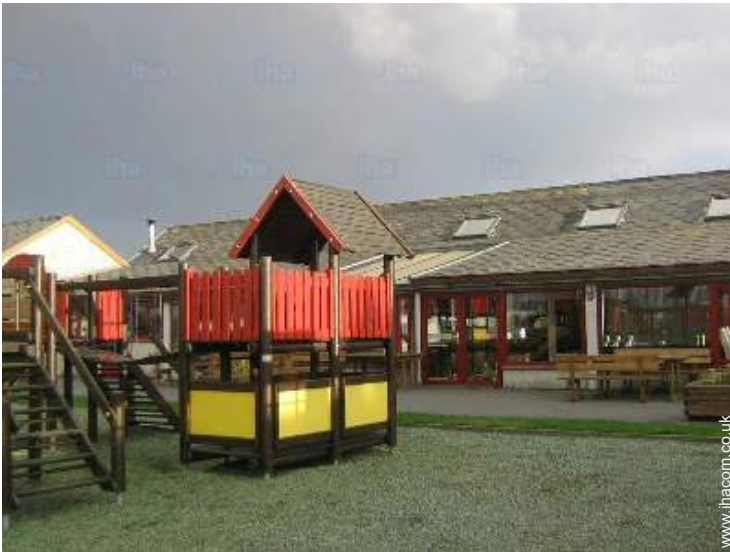
Attractions and relaxation