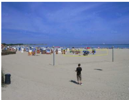
direct access to the beach