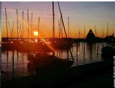
view of the port