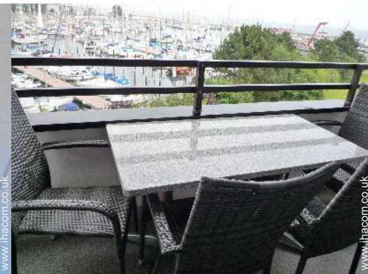
view from the loggia