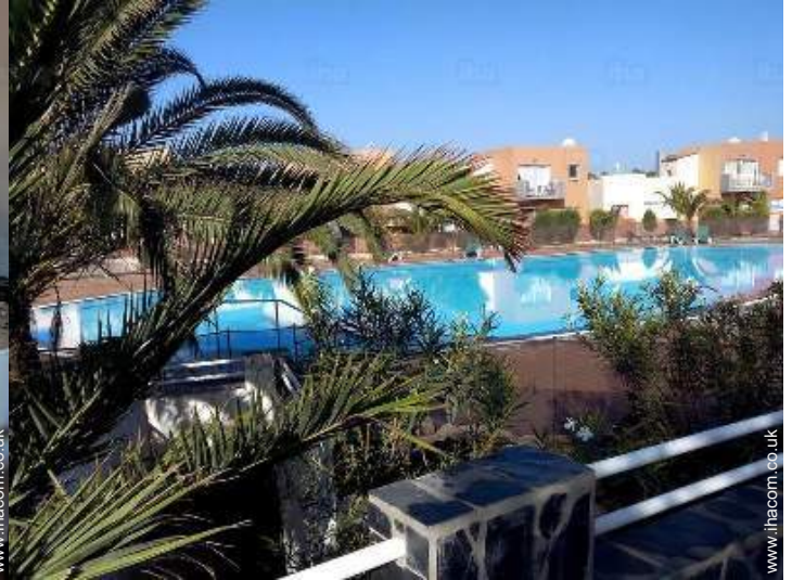
Cascading swimming pool