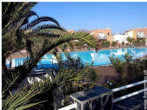
Cascading swimming pool