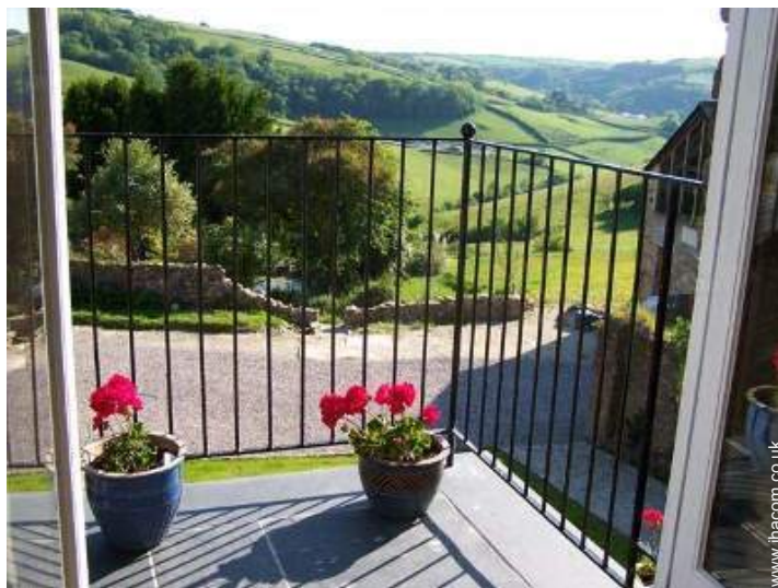
view over farmland