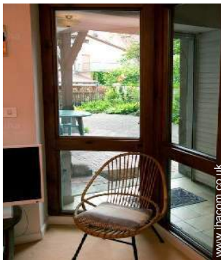
view from the sitting-room