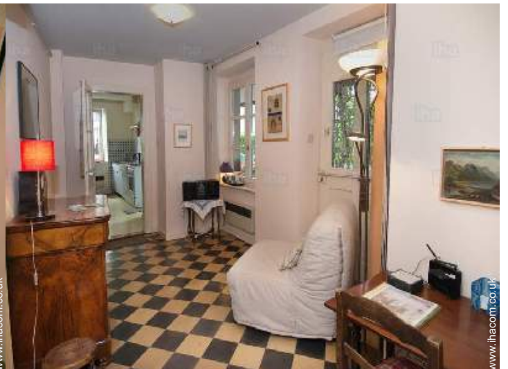
view from the sitting-room