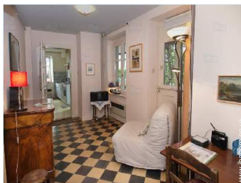
view from the sitting-room