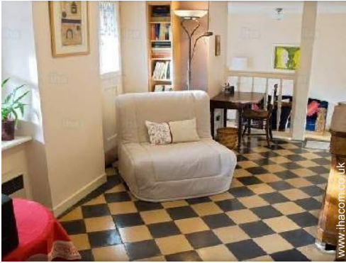
sofa bed(s) 1 pers