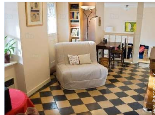
sofa bed(s) 1 pers

Garden table(s), 4 garden seat(s), parasol, 2 chaise(s) longue(s)