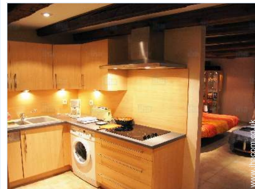
american style kitchen

Town centre <165' Bus stop / bus station <165' Bike/mountain bike hire 0.3mi. Car rental 0.93mi. Breadshop <165' Caterer <165' Local shops <165' Supermarket <165' High class retailers <165' Hairdressing salon <165' Internet cafe 0.93mi. Post office 0.62mi. Bank 165' Cash point 165' Chemist 330' Doctor 330' Nurse 990' Hospital 1.25mi.