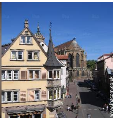
view from the flat