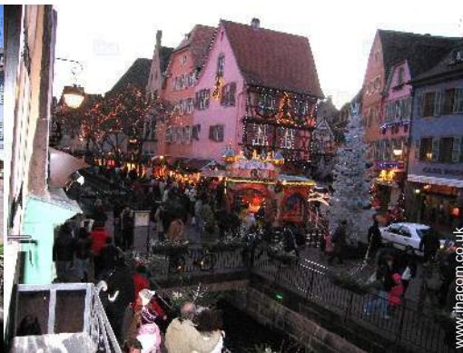
view over the square