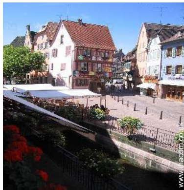
view over a pedestrianized street