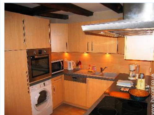
american style kitchen