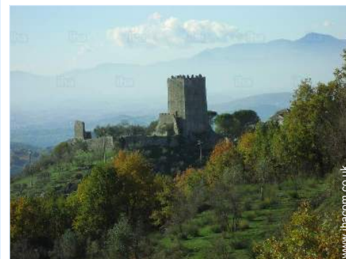
Towns close by

Nursery 9mi. Town centre 4.5mi. Bus stop / bus station 4.5mi. Bus pick up point beach 9mi. Bike/mountain bike hire 9mi. Scooter/motorbike hire 9mi. Car rental 9mi. Ski hire shop 31mi. Household linens for hire/laundry services 9mi. Breadshop 4.5mi. Local shops 4.5mi. Supermarket 4.5mi. Hairdressing salon 4.5mi. Internet cafe 3mi. Post office 4.5mi. Bank 4.5mi. Chemist 4.5mi. Doctor 3mi. Hospital 9mi. Dispensing clinic 4.5mi.