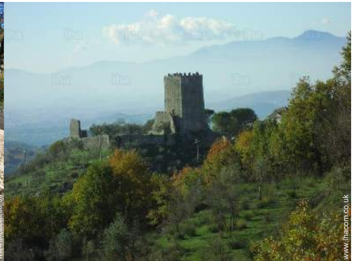
Towns close by