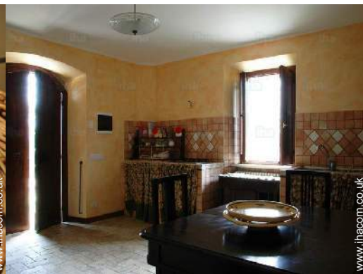
typical style kitchen