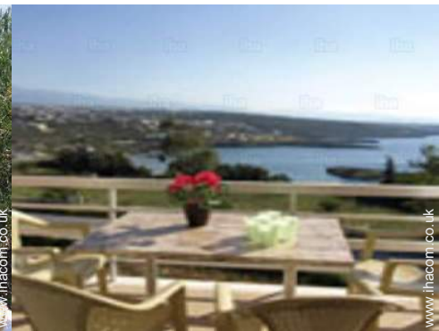
view from the balcony