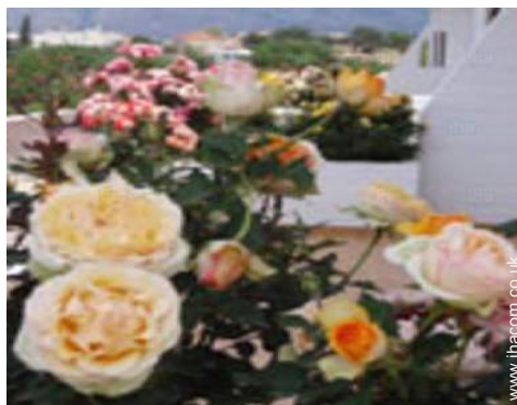
view from the veranda