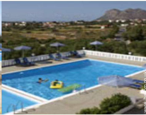
view from the swimming pool