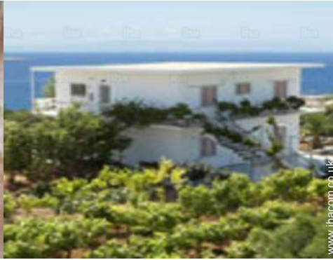
view of the sunset