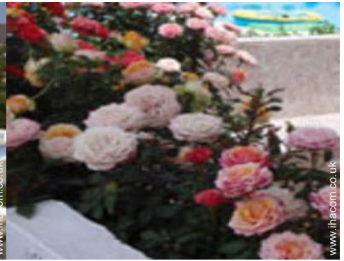
view from the flat