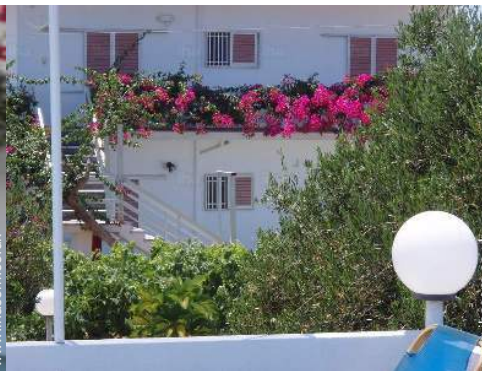
view from the swimming pool