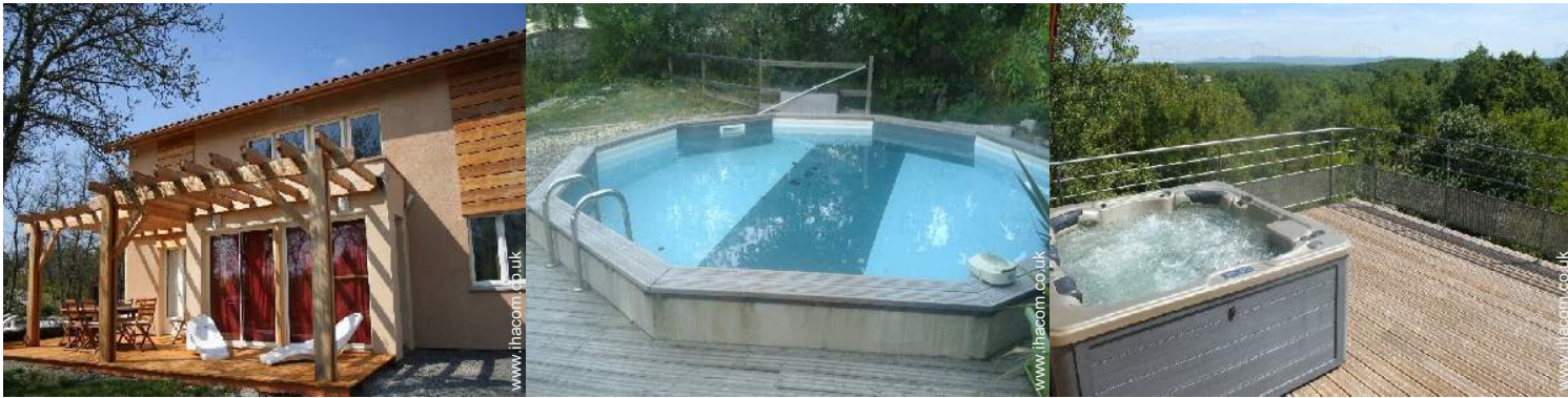
Original swimming pool