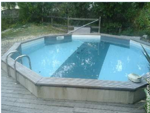
Original swimming pool