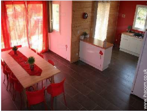
general floor plan