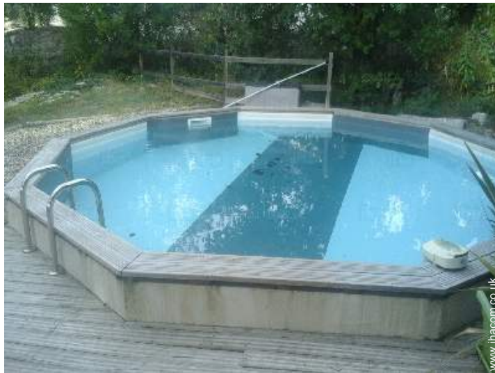
Original swimming pool