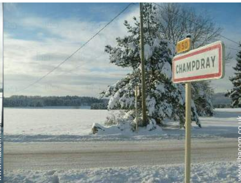
view of the village