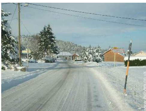
view of the village