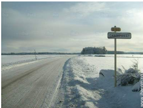
view of the village