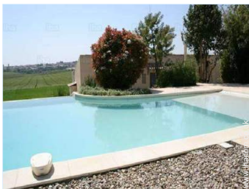
Original swimming pool