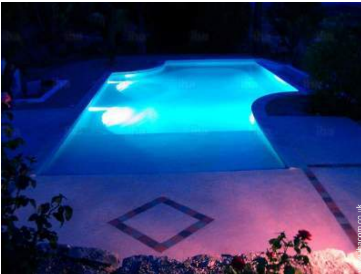
Cascading swimming pool