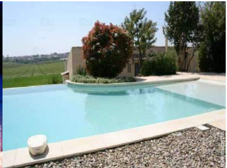
Original swimming pool