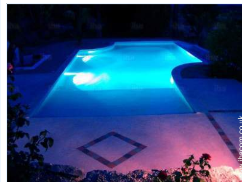
Cascading swimming pool

Village centre 0.93mi. Bus stop / bus station 0.93mi. Breadshop 0.93mi. Caterer 0.93mi. Local shops 0.93mi. Supermarket 1.25mi. Hairdressing salon 0.93mi. Post office 0.93mi. Bank 0.93mi. Cash point 0.93mi. Chemist 0.93mi. Doctor 0.93mi. Nurse 0.93mi. Hospital 12.5mi.