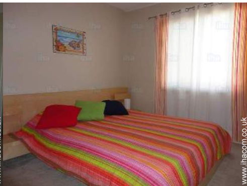
super king-size bed(s)