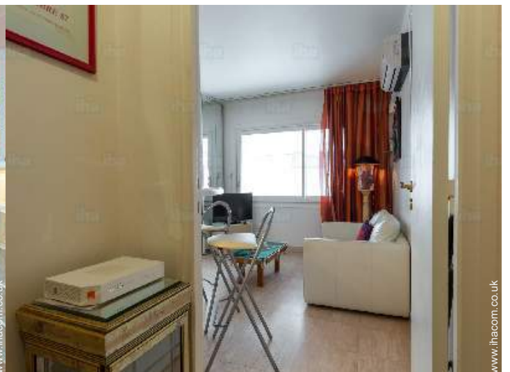
high speed internet access