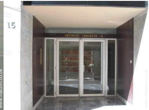
Modern block of flats