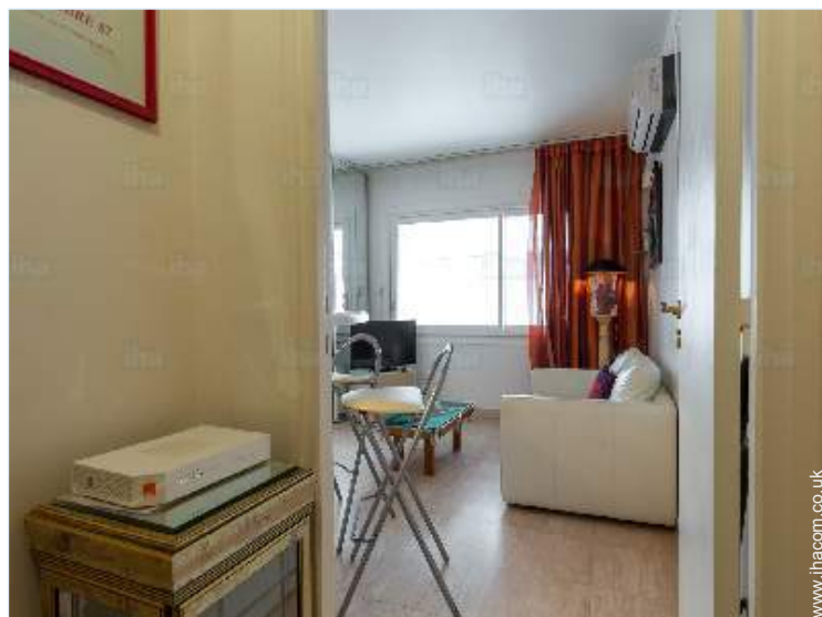
high speed internet access