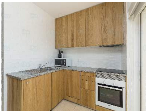
Guest facilities and furnishings