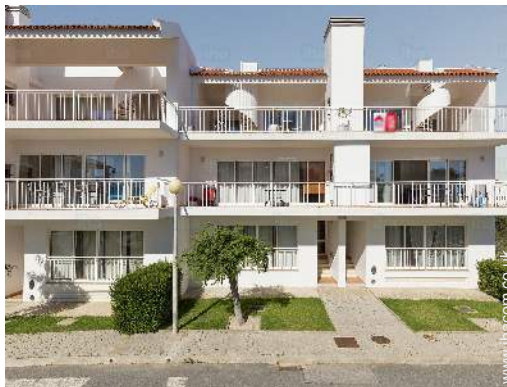
Modern block of flats