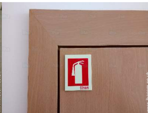
Equipment at the guest's disposal