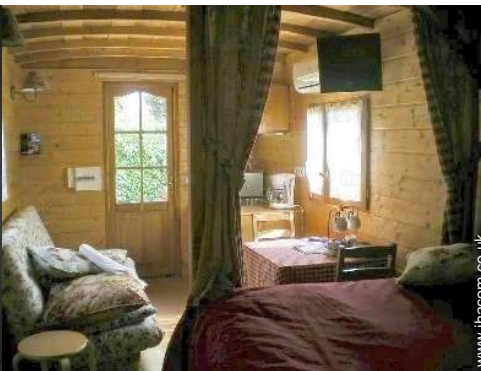
Guest facilities and furnishings