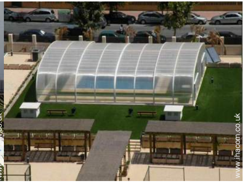
Covered swimming pool