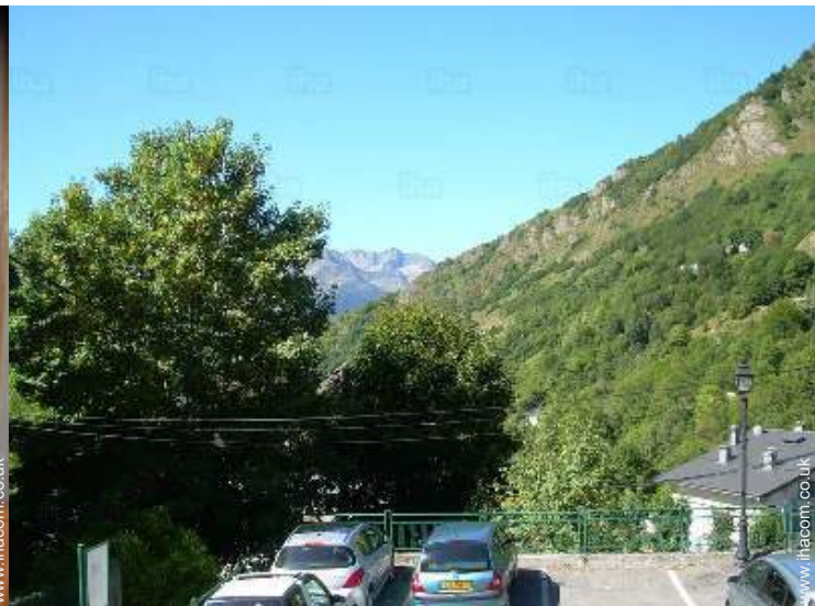
view from the flat