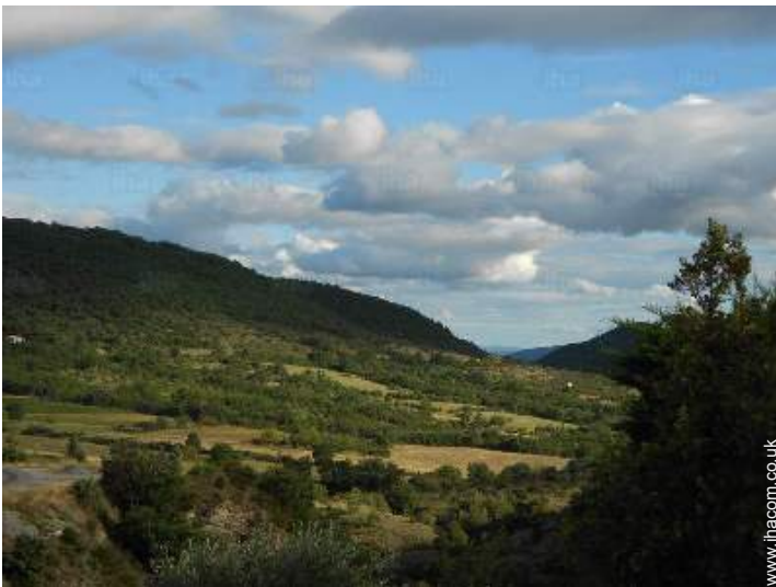
view from the terrace