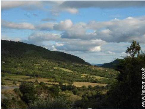
view from the terrace