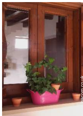
view from the covered terrace