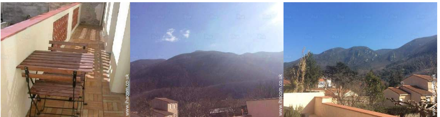
view from the flat