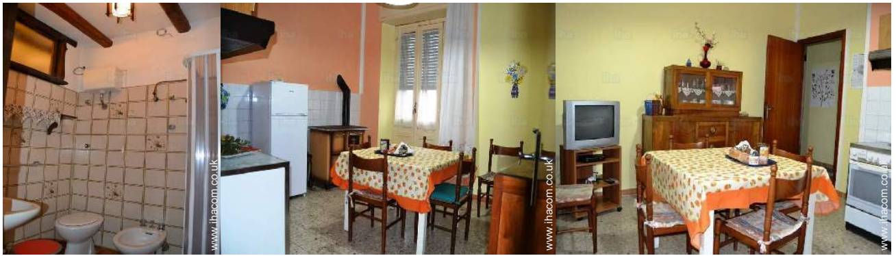
Interior layout and facilities