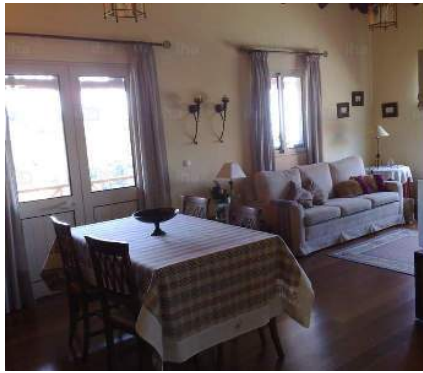
view from the dining-room