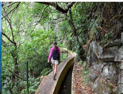
mountain pursuits nearby