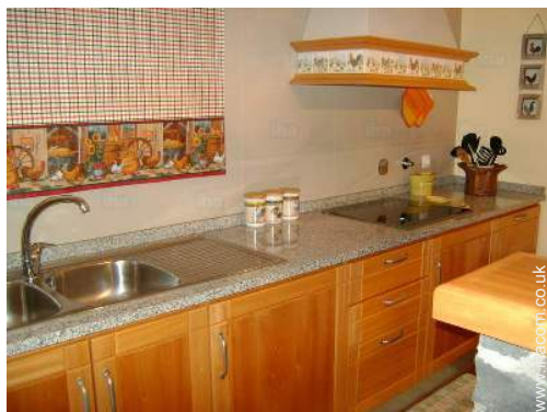
american style kitchen