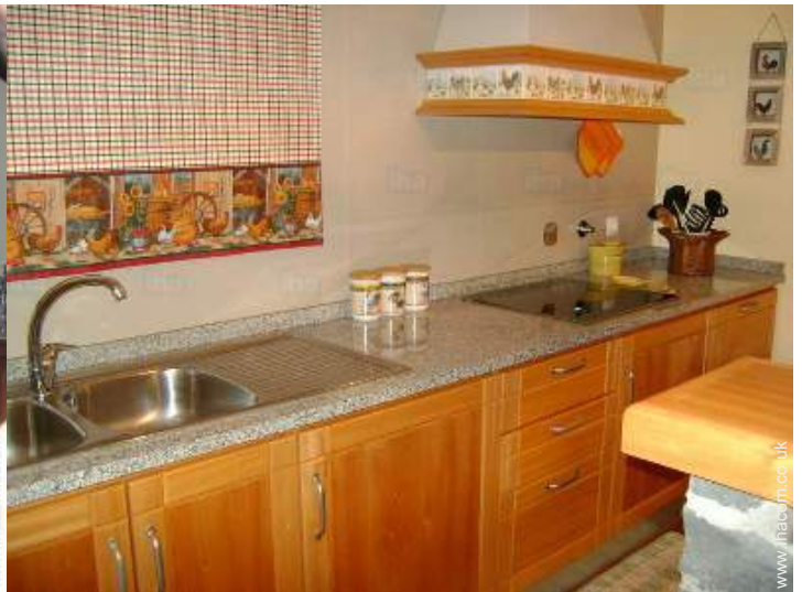
american style kitchen