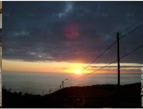
view of the sunset