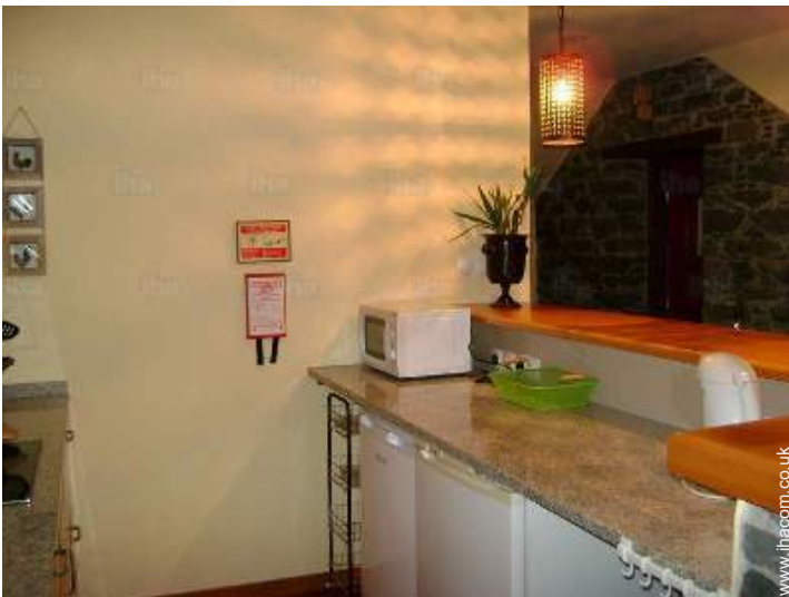
american style kitchen