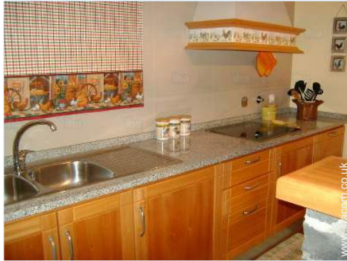
american style kitchen