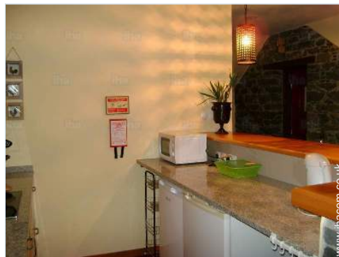
american style kitchen