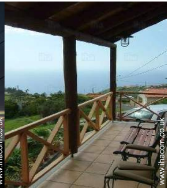
view over the sea