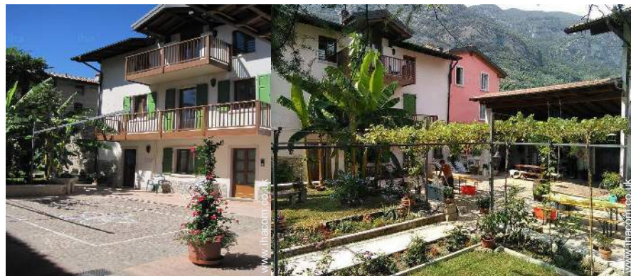
block of flats