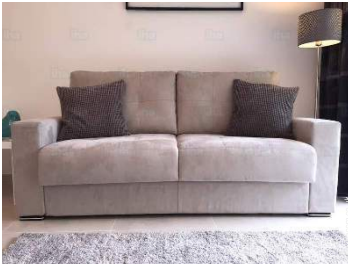
sofa bed(s) 2 pers