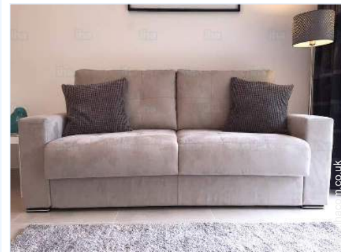
sofa bed(s) 2 pers