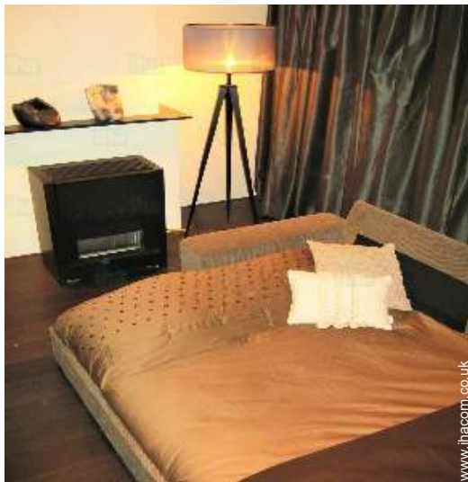
sofa bed(s) 2 pers