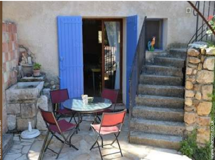
general floor plan