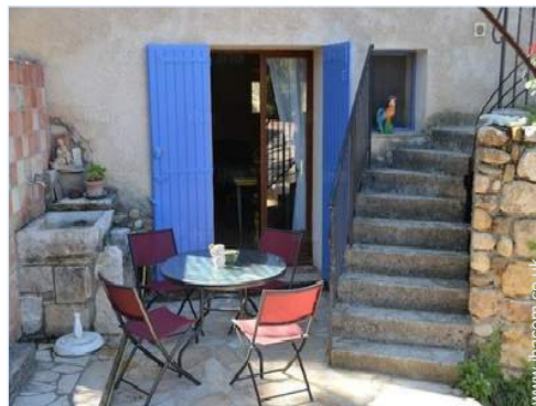
general floor plan